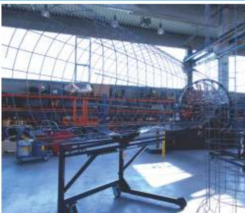
Production Capability ( Cages of 2500mm length per hour )